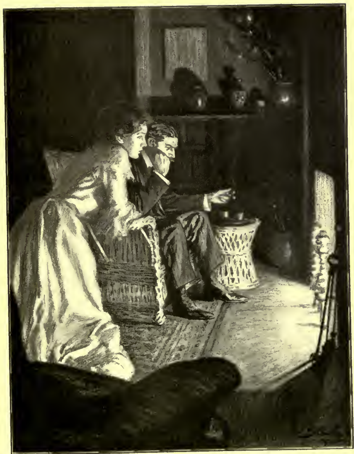
"SHE CAME AND KNELT DOWN BESIDE HIM"